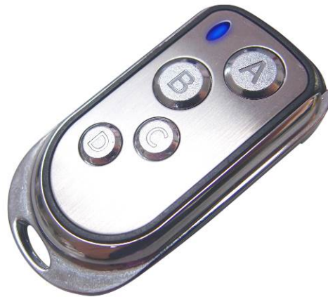
W-2 Wireless Transmitter

Wireless remote control system W-2 consists of a transmitter equipped with four buttons to turn faze output on or off, and adjust output volume; with an onboard receiver attach to the rear panel of Z-380.